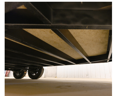
TUBE FRAME & Z-TECH UNDERCOATING