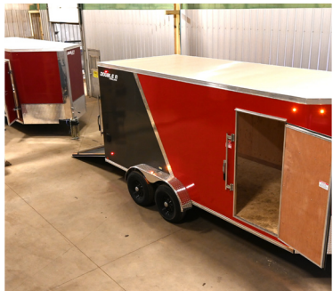
1 PIECE SEALED ROOF