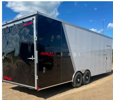
4 HINGE RAMP DOOR