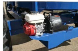
HD13 - 13HP Honda Transfer Pump