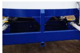
FWRH - Rear Receiver Hitch