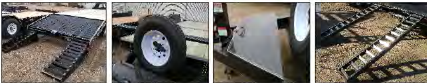
BT2 - Beavertail With Centre Lift & Spring Assist Ramp SP3 - Spare Tire & Rim TB1 - A Frame Toolbox R7-7' Slide In Ramps