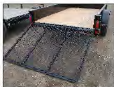
G4 - 4' Ramp Gate