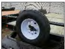
SP1 - Spare Tire & Rim